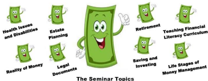
The Seminar Topics

Registration for the NC DKG's Building Competency in Planning & Teaching for Financial Well-being seminar ends May 5. It is a seminar you can't afford to miss. No matter your current level of financial wellness, whether you are working or retired, you will receive information to assist in planning for a fabulous future. Learn more about financial management, investments, maintaining important documents, and the NC Financial Literacy Curriculum K-12.